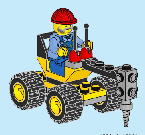
LEGO, the LEGO logo, the Brick and Knob configurations and the Minifigure are trademarks of the LEGO Group. ©2022 The LEGO Group. All rights reserved. Manufactured by Blue Ocean Entertainment AG under licence from the LEGO Group.